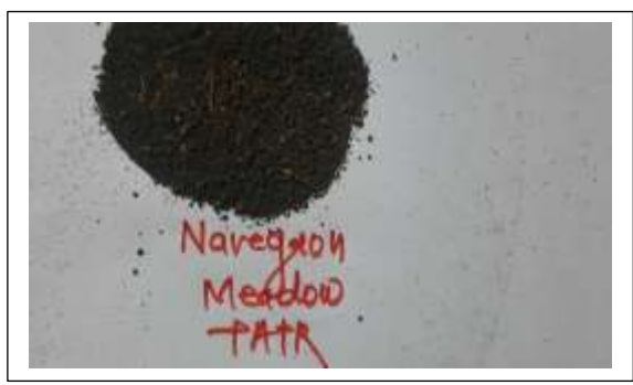
LOAMY BLACK SOIL